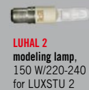
LUHAL 2 modeling lamp, 150 W/220-240 V for LUXSTU 2