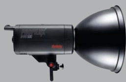
LUXSTU 5* flash unit, 500 Ws